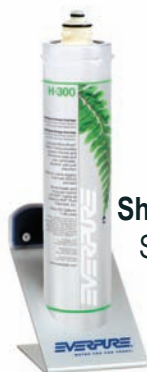
Part No. EV7012-77 Showroom Cartridge Holder Sleek and attractive counter display looks great in the smaller showroom. $25.00