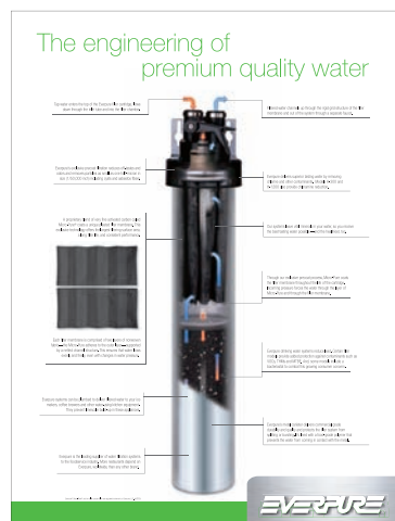
Precoat Advantages Poster Laminated (24" W x 36" H)