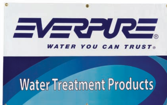
Vinyl Hanging Banner (42" W x 27" H) Part No. EV7002-68

Let your customers know you carry Everpure.