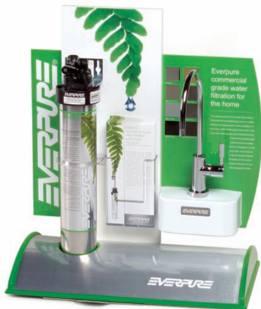
Part No. EV7013-42 Filter/Faucet POD Merchiser Price: $150.00