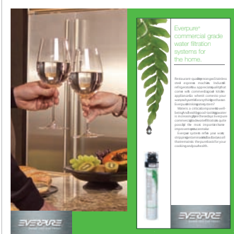
POS Counter Display w/Easel Back (11" W x 14" H) (Brochures not included)

water sustains life, ours sustains a lifestyle. [commercial grade water filtration from everpure]