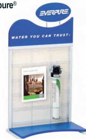
Display Rack Part No. EV7012-45

(Displays do not include Everpure filter cartridges and literature)