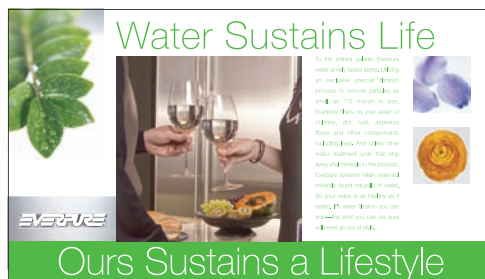
POS Floor Display Insert Two-Sided (16" W x 9" H)