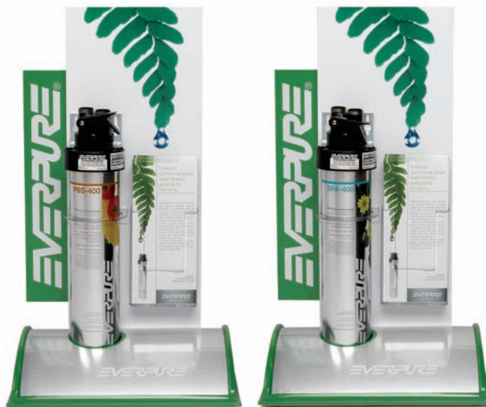
Part No. EV7013-43 Filter Merchiser for SPA/PBS Price: $98.00

(Display does not include Everpure filter cartridge, head and faucet)