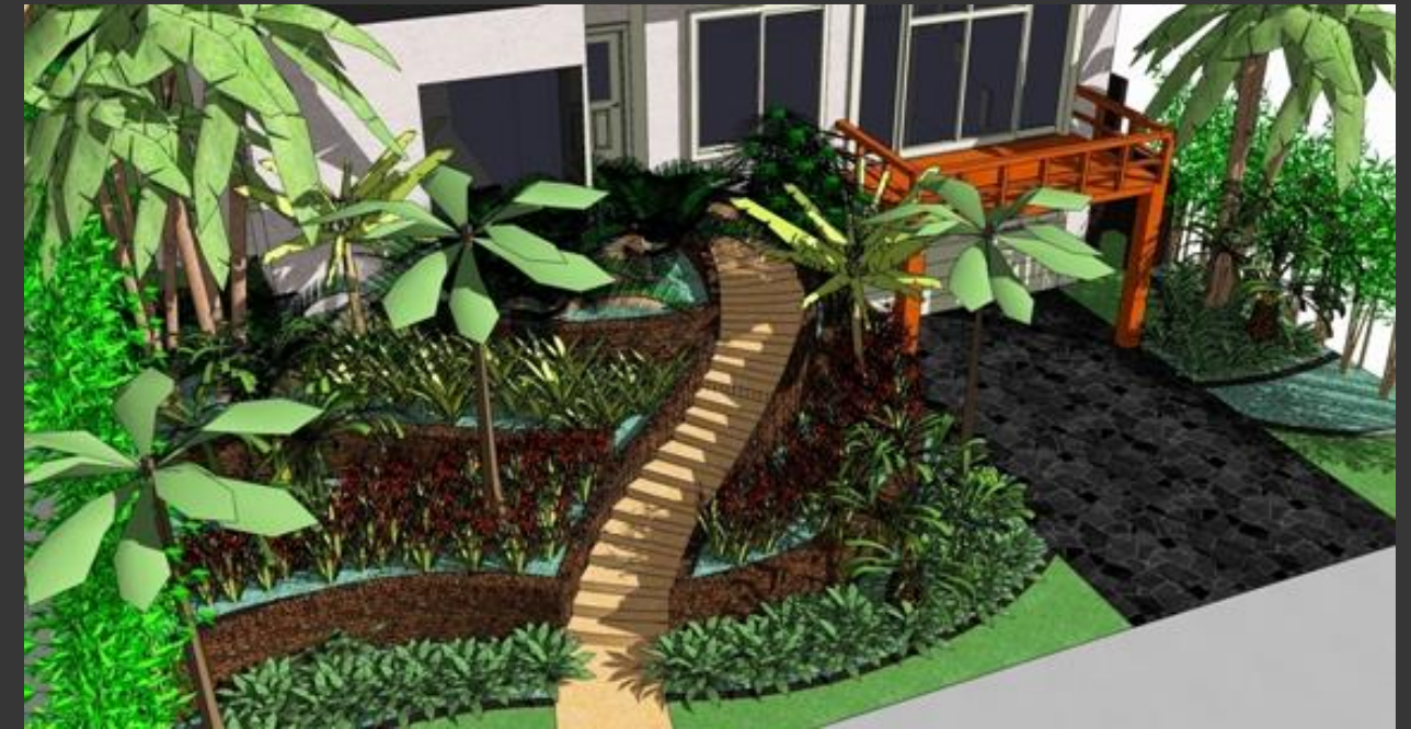
PRIVATE RESIDENCE, LA JOLLA, CALIFORNIA