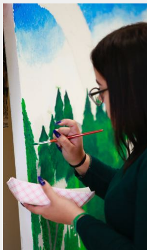
New Banners To Be Raised at VAPA.