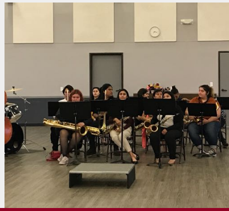
Spring Tour, 2019 Legacy VAPA