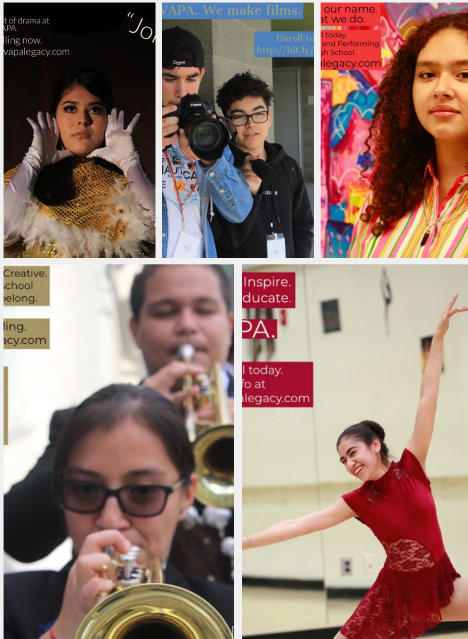
Recent Legacy VAPA Ads

https://legacyvapa.smugmug.com/Theatre-Musicals/Little-Shop-of-Horrors-/Little-Shop-of-Horrors-/