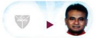
Kovalan • 5Arts2