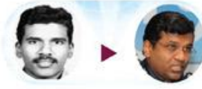
Rajeentheran • 5Sc3