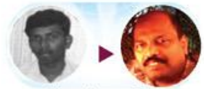
Karunaharan • 5Sc1