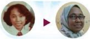
Hawaiatun • Form 6