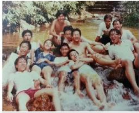
A day out