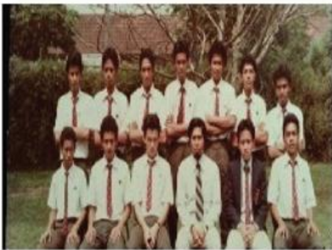
Sepak takhraw team