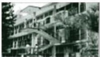
New 3-Storey Block