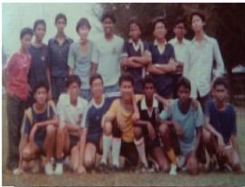
Arts 1 football team