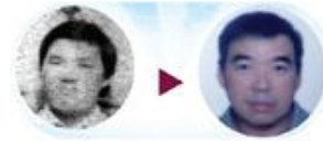
C H Thian • 5Arts2