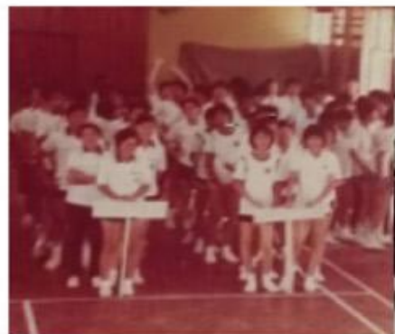
Indoor games participants