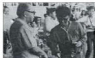
Prize giving by Tun Razak