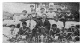
Hockey - U-15 Selangor State Champion