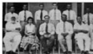
The Staff of 1958