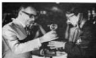
Prize giving by Tun Hussein