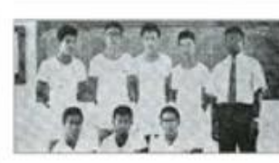
Badminton - Selangor State Champions