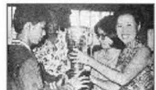
Badminton - Agong's Trophy Champions