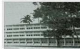
Red Block 2