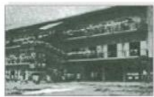
Red Block 1