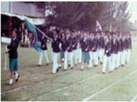
Sports Day march pass