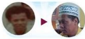
Zainurin • 5Arts3