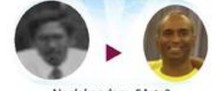
Neelakandan • 5Arts3