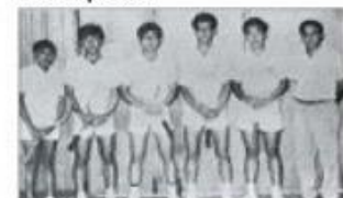
Tennis - Wilson Trophy Champions