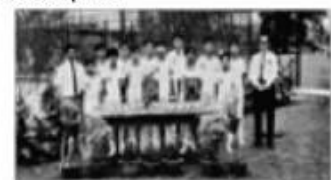
Gymnastics - MSSM 1971 Champions