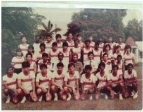
Sports Day participants