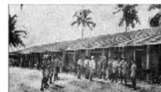
Pioneer Scout Group